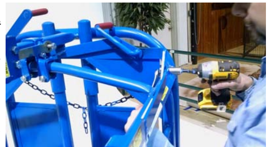
Fig. 13 Securely Tighten Nuts On Side Supports

Securely tighten six (6) nuts on lockbox mounting bracket (FIG 15).