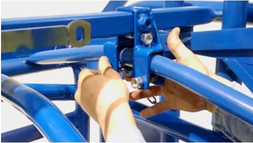
Fig. 10 Locate Support Bracket Over Top Rail