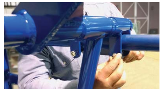
Fig. 7 Insert Bolts & Nuts Through Side Mounting Brackets

Reattach linkages from lockbox to swingarms on steer pusher (FIG 9).