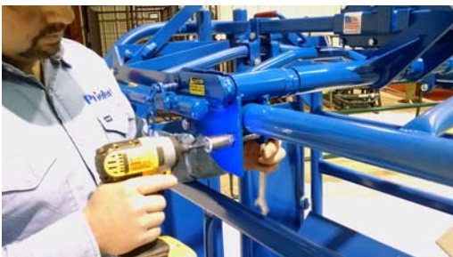
Fig. 14 Securely Tighten Nuts On Mounting Brackets