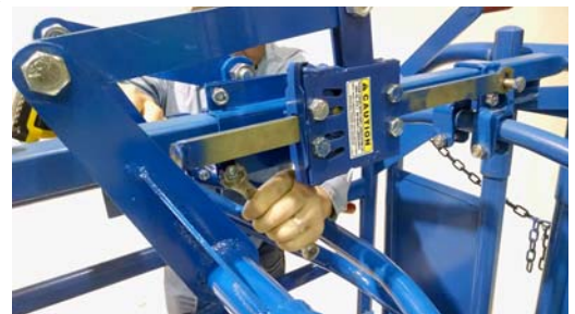
Fig. 15 Securely Tighten Nuts On Lockbox Mounting Bracket

IMPORTANT: Tighten top linkage nuts until snug, then loosen by 1/2 turn to allow free movement (FIG 16).