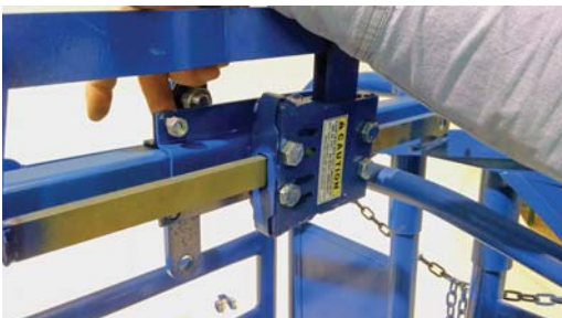
Fig. 8 Attach Lockbox Brackets