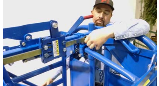
Fig. 11 Attach Lockbox Linkage To Rear Mounting Bracket

NOTE: Newer models will not require rear support bracket, Lockbox will attach to existing arms on the release mechanism top rail.