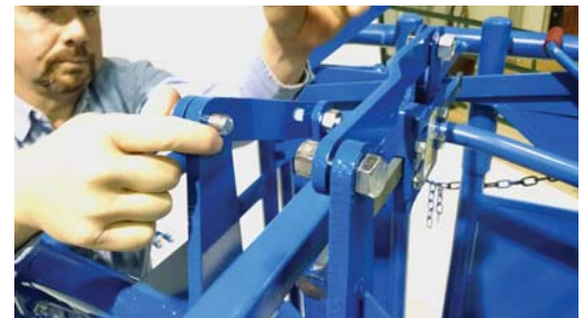
Fig. 9 Reattach Linkages

NOTE: DO NOT TIGHTEN ANY HARDWARE UNTIL ALL PARTS ARE ASSEMBLED.