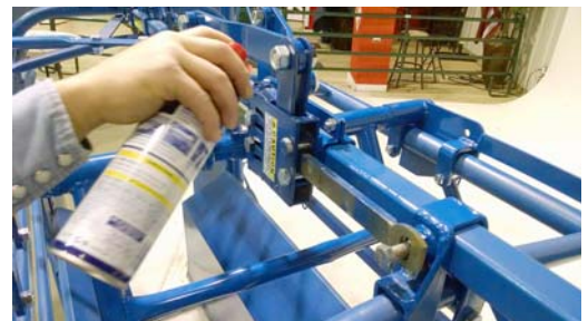
Fig. 17 Lubricate All Moving Parts

Actuate handle several times to distribute lubricant and check operation. If necessary, loosen top linkage to provide free movement.