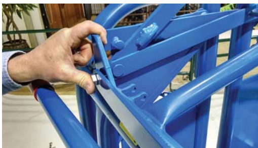
Fig. 6 Attach Side Supports