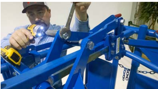
Fig. 16 Loosen Top Linkage Nuts by 1/2 Turn