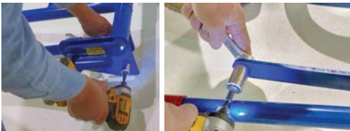
Fig. 2 Remove Nuts & Bolts From Supports

CAUTION! Keep hands from between linkages, support arms & brackets to prevent injury during installation.