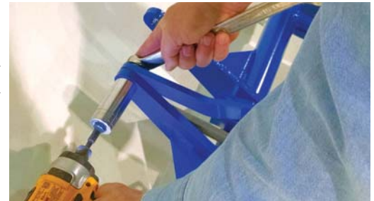
Fig. 3 Remove Nuts & Bolts From Swingarms

Remove bolts & nuts from upper swingarms and remove lockbox, mounting brackets, and linkages, set aside (FIG 3).