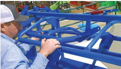
Fig. 4 Slide Steer Pusher Into Rear Opening