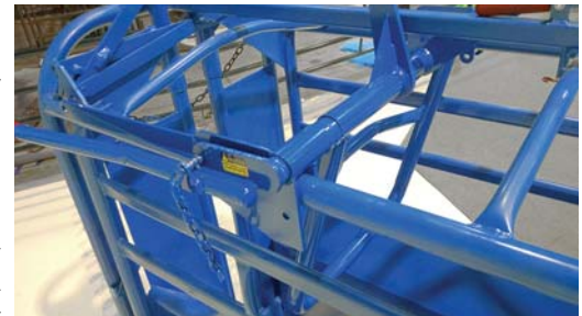
Fig. 5 Locate Steer Pusher Over Top Side Rails

Locate over top side rails of chute, with side supports facing towards the rear chute doors, and aligning with rear mounting holes on the top rails (FIG 5).