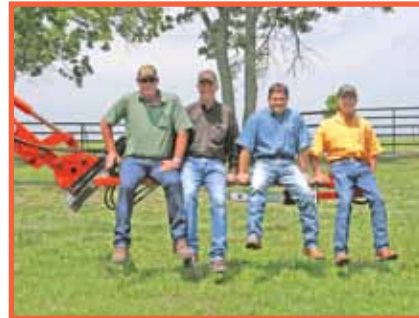
850 lbs of weight is no match for the Limbinator's™ solid-steel frame