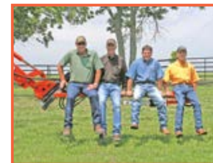
850 lbs of weight is no match for the Limbinator's™ solid-steel frame

For unsurpassed durability, the LimbSaw's extension arm is made from heavy-duty square tubing that is double-walled at the cutting end. While most chainsaw bars are laminated, the LimbSaw's chain bar is made from a single piece of hardened alloy steel , and is laser cut for precision. Kickback is not an issue with the LimbSaw because each saw is equipped with an aggressive chain that utilizes each and every tooth for maximum cutting power.