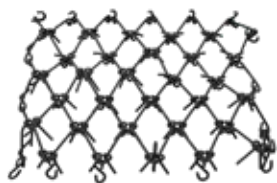
Chain Harrow Mats