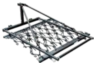
Chain Harrow w/ Lift Kit